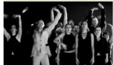
Cullberg Ballet, Stockholm, »Point of eclipse«, Opening night