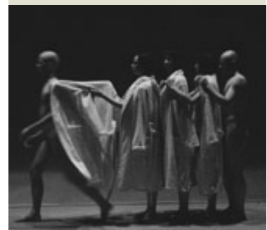
Compagnie Mossoux – Bonté, Brüssel »Nuit sur le monde«, Final night