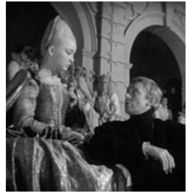
Video lecture »Hamlet – ein modernes Drama« / Scene from the film by Grigorij Kosinzew, Moskau 1964